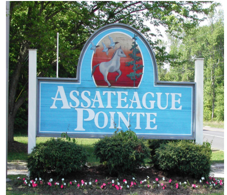
Front Entrance to Assateague Pointe